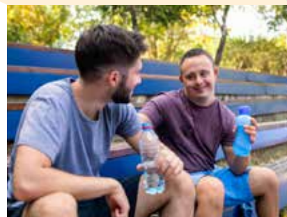
Individual support in the community