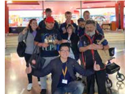
'Social Saturday' (community & centre-based activities)