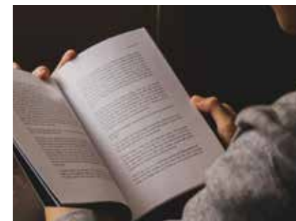
Literacy and numeracy