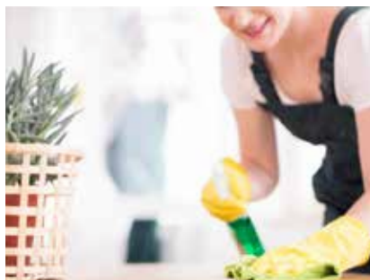
Individual support at home