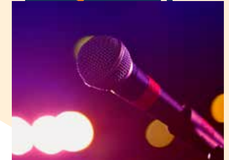
Choir and karaoke with 'Bedford Beats'