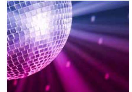
Disco night 'Club Slick'