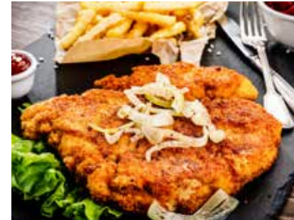
'Pub & Grub'