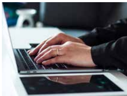
Technology – Learn computer basics