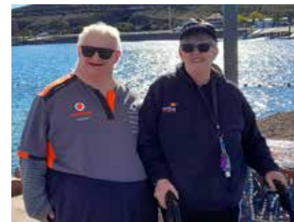
Holiday activities over Christmas