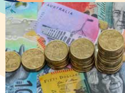
Budgeting course 'Better Budgets'