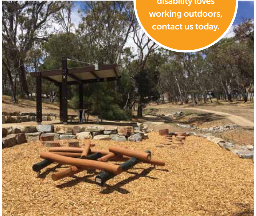
Pictured: APG's new nature play space at The Crest

The new $27 million housing development by Mill Hill Capital will boast 150 landscaped homes, cafés, nature play spaces, walking trails and even a tourist park.