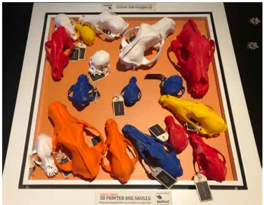
Pictured: Bedford skulls on display.